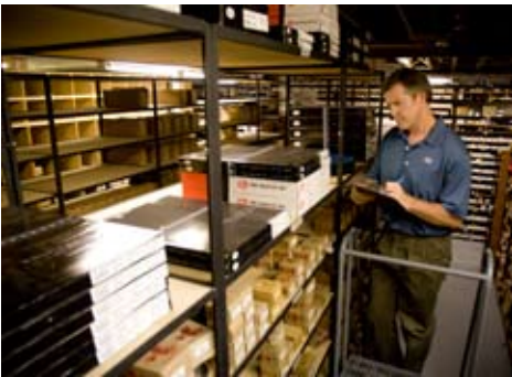
Belts should be stored in original packaging.

Improper storage will damage the tensile cords and cause premature failure.