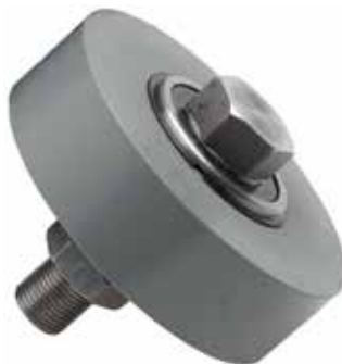
Flat Idler Pulleys