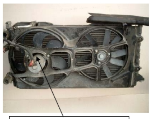
Fig. 1: Electrically driven fan

Usually the basic engine configuration only has one fan, which is electrically driven (system installed on radiator) as can be seen in Figure 1.