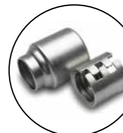
The patented "C" insert pictured outside of the ferrule.

MegaCrimp® couplings set a new standard for hydraulic couplings. The unique "C" insert ensures "weep-free" concentric crimping to keep equipment and the environment clean.