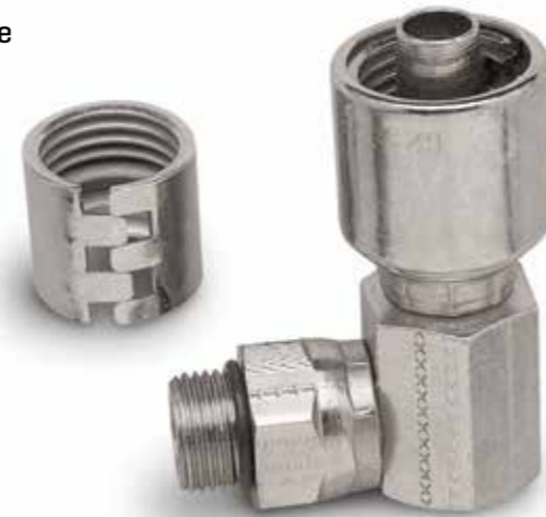
The revolutionary MegaCrimp® coupling.