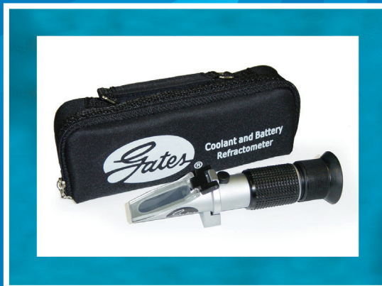
COOLING AND BATTERY REFRACTOMETER. PART No. 91001