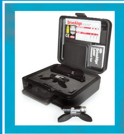
DRIVE ALIGN LASER ALIGNMENT TOOL. PART No. 91006