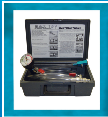
AIR LIFT COOLING SYSTEM VACUUM FILL TOOL. PART No. 91003

A new range of quality tools designed to let you work faster, smarter & better.