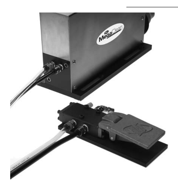
Step 2: Connect Twin Line Air Hose Air connections on the Bench Mount Launcher and Foot Pedal are color coded to match the twin line air hose. Twin line air connections between the bench mount unit and foot pedal must be made first before connecting main air supply to foot pedal.