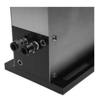
Step 1: Make sure Bench Mount Unit is properly secured to a sturdy work surface.