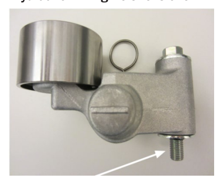
Apply Threadlocker to tensioner pivot bolt threads prior to installation.