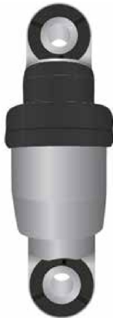
Typical Hydraulic Type Tensioner